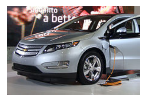
The Chevrolet Volt operates primarily as a series hybrid.

This is a series-hybrid arrangement and is common in diesel-electric locomotives and ships (the Russian river ship Vandal, launched in 1903, was the world's first dieselpowered and diesel-electric powered vessel) and Ferdinand Porsche successfully used this arrangement in the early 20th century in racing cars, including the Lohner-Porsche Mixte Hybrid. Porsche named the system System Mixte, which had a wheel hub motor arrangement, with a motor in each of the two front wheels, setting speed records.